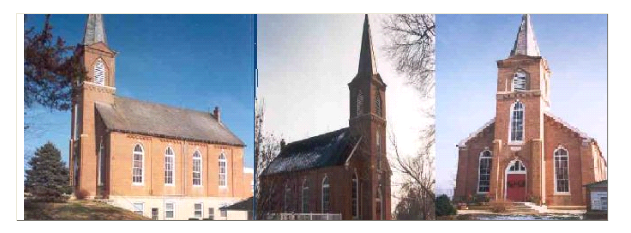
Second Cemetery is south of the Church