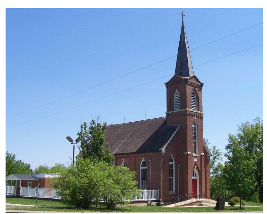
Reformatted: Static File, 29 January 2024

First Cemetery is south of parsonage and left of road. Second Cemetery is south of church and right of road. Third Cemetery is not visible; it is north of church and in the background at end of road.